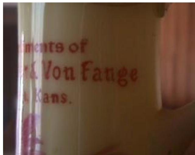
The Hackmeister-Von Fange complimentary cream pitcher from Natoma, KS