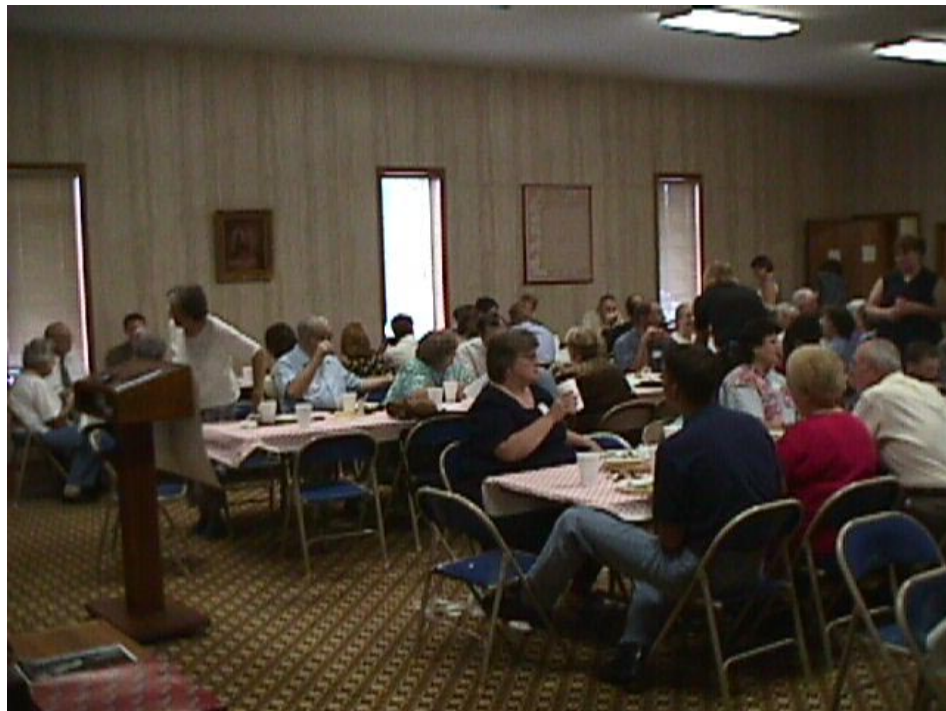
Family members enjoy the noon meal at the reunion in Lincoln, Kansas